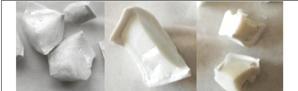
Fig.1 Samples with increasing PbO and SnO 2 content: SV26, SV16, SV17.

After that, we aimed producing opaque glass by melting SnO 2 opacified glass to transparent glass. However, we encountered problems of replicability of the correct opacification level [4]. No information on SnO 2 crystallization in similar matrices could be obtained from literature, though a number are present on lead glazes [5][6].