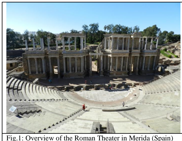
Fig.1: Overview of the Roman Theater in Merida (Spain)

Emerita Augusta (Merida) is a Roman archaeological city listed by UNESCO in 1993, where the Theater is the most representative monument of the whole ensemble (Figure 1).