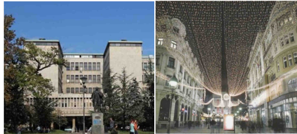
Faculty of Mathematics Mathematical Institute

Registration and information to access the meeting rooms are available in the main entrance of the Faculty of Mathematics.